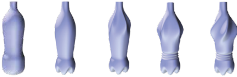
Parameter editing, point editing, and global deformation tools give you maximum flexibility over your designs.