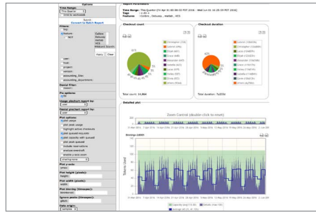
View user checkouts, session lengths, and number of licenses used