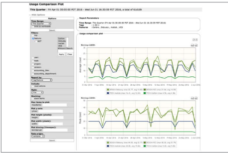
Plot and compare average vs. peak license usage