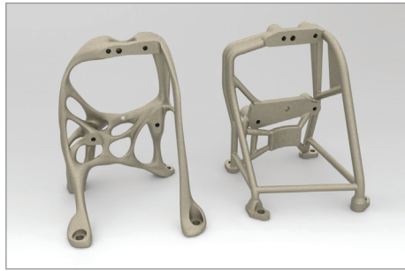
Optimized and 3D printed metal aerospace bracket